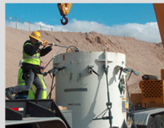
Operations / Planning

Every Problem is Unique; Your Success is Our Priority.