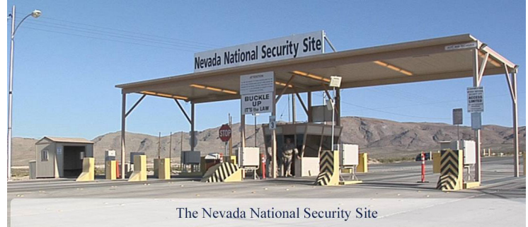
The Nevada National Security Site

Every Problem is Unique; Your Success is Our Priority.