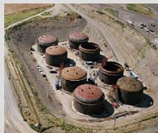
Subject Matter Experts