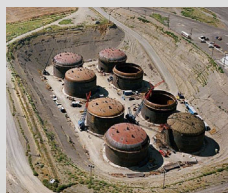
Subject Matter Experts